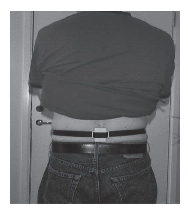
FIG. 1. Position of the ActiGraph on the participant

The GT3X accelerometer was calibrated according to the manufacturer's specifications. The epoch interval used was set at 1 sec., and output was expressed as the mean number of counts per second. Each participant was monitored during each game played. The accelerometer was attached to a belt at the height of the participant's back (Fig. 1). Data were uploaded from the monitor to a computer after the testing period.