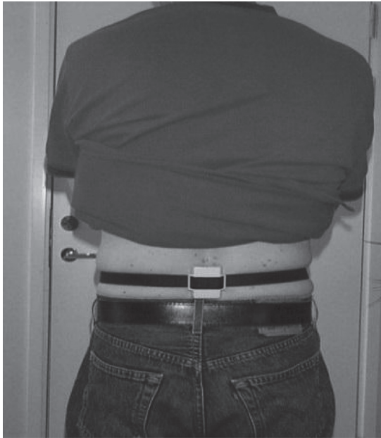
FIG. 1. Position of the ActiGraph on the participant

The GT3X accelerometer was calibrated according to the manufacturer's specifications. The epoch interval used was set at 1 sec., and output was expressed as the mean number of counts per second. Each participant was monitored during each game played. The accelerometer was attached to a belt at the height of the participant's back (Fig. 1). Data were uploaded from the monitor to a computer after the testing period.